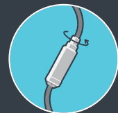
Swivel on cable prevents cable tangling