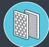
Dual-level filtration options