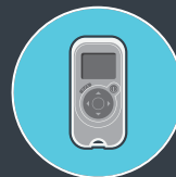
Remote control setup of parameters and cleaning programs