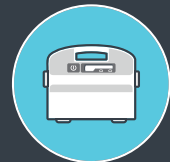
Filter indicator on power supply