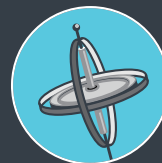
Gyroscope for better scanning